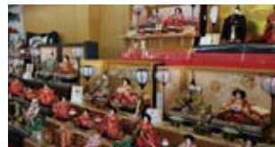
Dolls for girl's festival

You will find shops that have unique Japanese goods. (dried bonito, Kimono, uniform etc.)