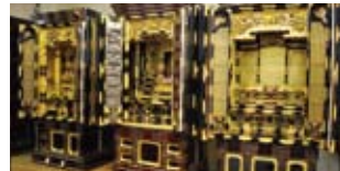
Family Buddhist alter