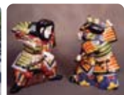
Mikawa Clay Dolls

The Third Folk craft Hall was built around the theme of 'Shelter'