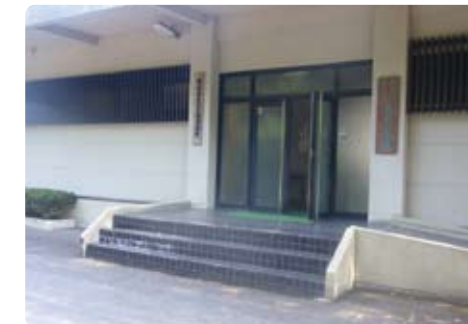
6 Ceramics Museum

Special exhibitions are also held several times a year.