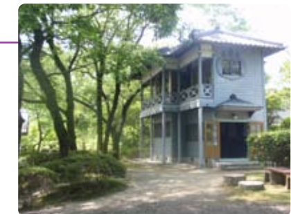
5 Inoue Family Western-Style Residence

As exquisite view of Kanpachikyo can be enjoyed from the Tea room