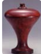
Negoro Lacquerware Vase