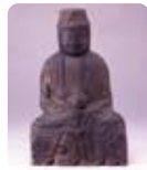
Buddha Statue by Enku