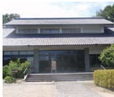
3 Third Folk Craft Hall