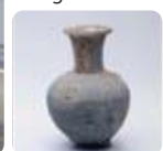
Sue unglazed Bottle