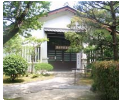
1 First Folk Craft Hall