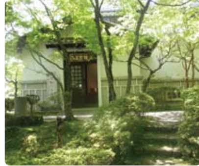
2 Second Folk Craft Hall