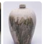
Ash glaze Pot