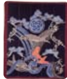
Bed Cover Glue Resist Dying Technique