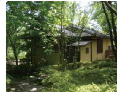
4 Tea Arbor 'KANOUTEI'

As exquisite view of Kanpachikyo can be enjoyed from the Tea room