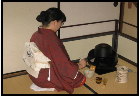
A. Sado: Tea Ceremony ¥200

The Japanese Culture Group of Toyota International Association (TIA) is providing an introductory class about Japanese culture as follows. Please contact TIA if you are interested.