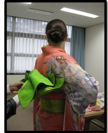
C. Kimono ¥300