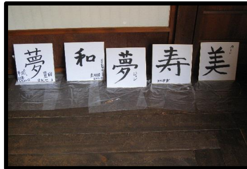
E. Shodo: Calligraphy ¥100