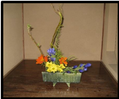
D. Ikebana: Flower Arrangement ¥1000 ※Advance payment