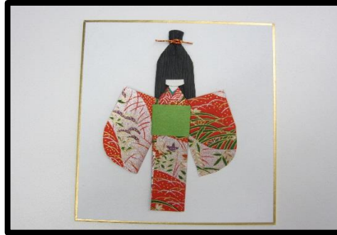
B. Origami: Paper Folding ¥100