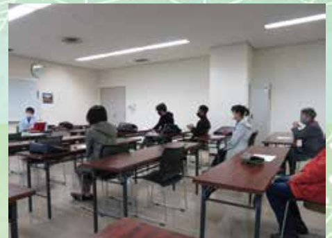
Alpha Japanese Class