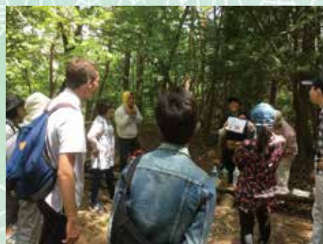
Toyota Hospitality Guide Network