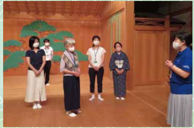
English Information for Friends (E-IFF)