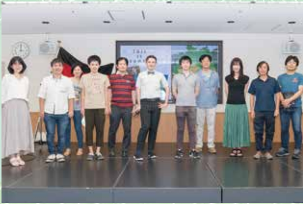
English Volunteer GLOBE

Although there were restrictions on a number of activities, due to the influence of the pandemic, TIA was especially fortunate to have had the cooperation of 11 groups promoting their activities under the 3 areas of international exchange, international understanding and multicultural coexistence.