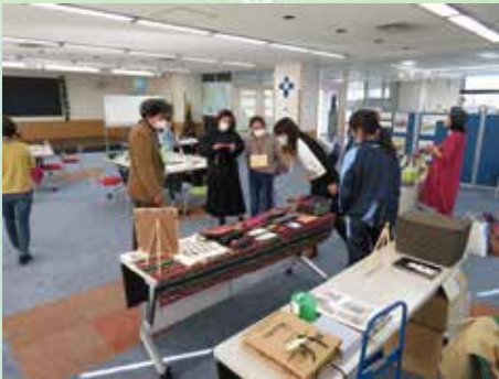
Child Needs Home