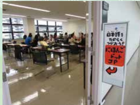
Nihongo dot JP