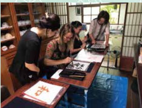
Japanese Culture Group