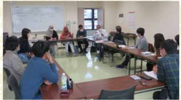
English Volunteer Group GLOBE