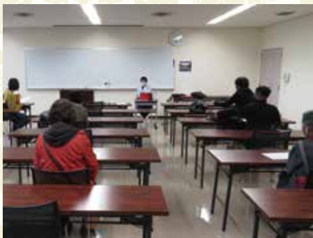
Alpha Japanese Class