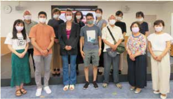
E-IFF (English Information for Friends)

Despite the restrictions on their activities due to the coronavirus, 11 groups have proceeded with their activities, cooperating with TIA's projects while taking measures to prevent the spread of infection.