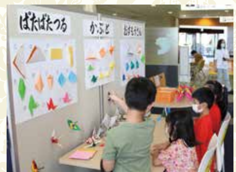
Japanese Culture Group