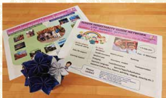
Toyota Hospitality Guide Network