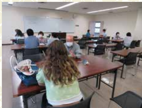
Nihongo dot JP