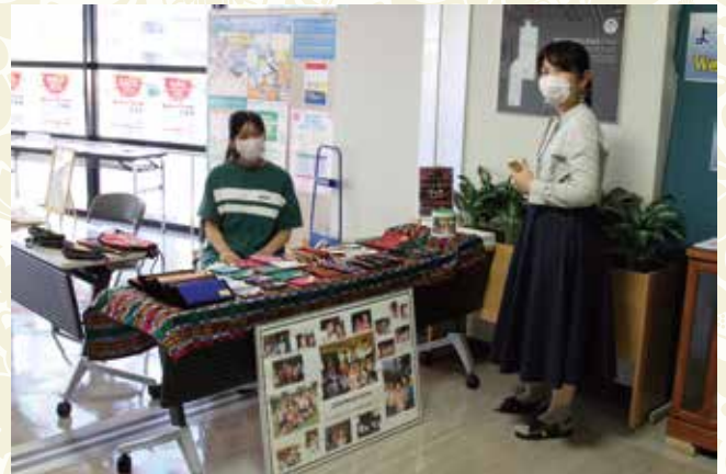
Child Needs Home